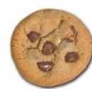
Peanut Butter Cup Cookie Dough Item 44090