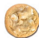
White Chip Macadamia Nut Cookie Dough Item 44097