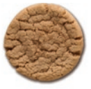
Snickerdoodle Cookie Dough Item 44005