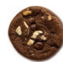
Double Chocolate Brownie Cookie Dough Item 44049